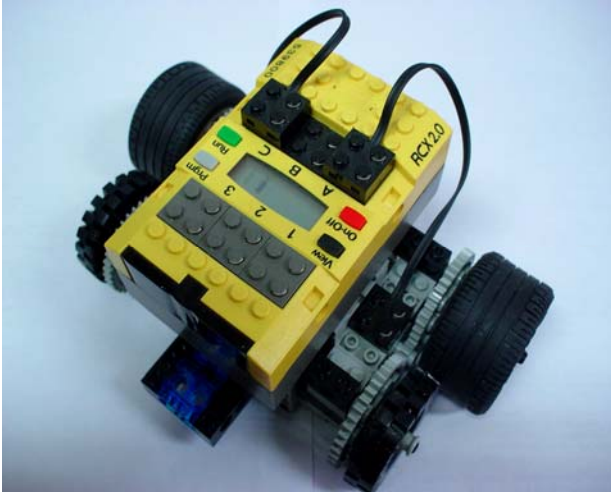
Fig. 3 Roverbot